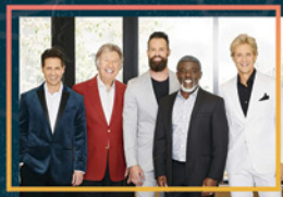
GAITHER Vocal Band